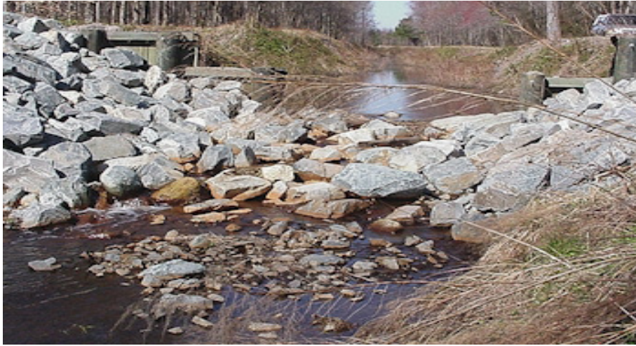
Figure 1 - Typical rock check structure

The Rock Check Dam should be inspected after every rainfall event, and repaired as necessary.